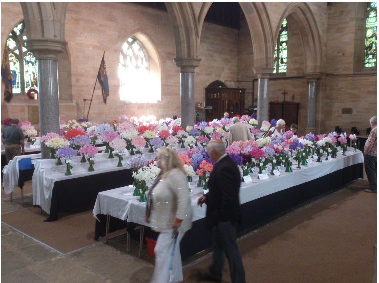
Yorkshire Sweet Pea Championships 2014