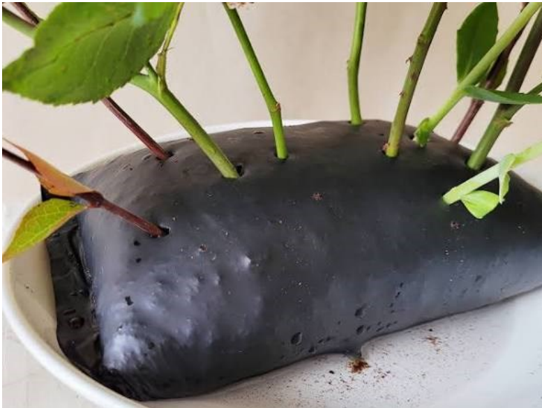
The Oshun Pouch

Another product of interest for decorative classes is the Oshun Pouch. This is a plant-based, and home-compostable alternative to traditional plastic floral foam, designed for sustainable flower arranging; it's a flat, expandable pouch filled with coconut coir and a gelling agent that absorbs water, expands, and holds stems securely, eliminating microplastic waste and enriching soil after use. It's a zero-waste system for florists seeking eco-friendly mechanics. I have not used this but have seen a review that says it is best used for 'on the day' arrangements or at a pinch the day before. It is also fairly expensive at £4.25 plus postage for a 13cm-13cm pouch.