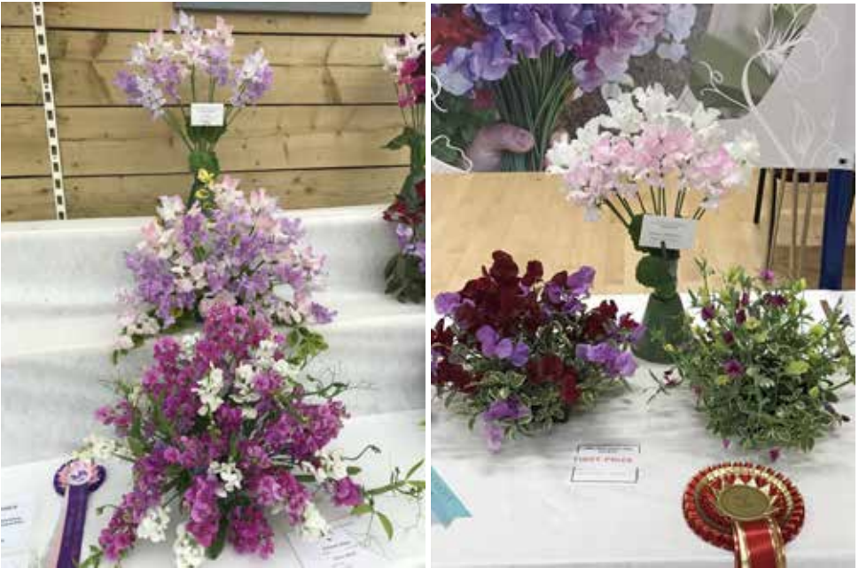
Two examples of staging this type of class from 2025 (one being at the Early National and one at the Chiltern Show)

Thus, to maximise your chances of success in this class, you could show a vase of say Spencers, a vase of Modern Grandiflora and a saucer of Annual species or a vase of Old Fashioned, a saucer of perennial species and a saucer of Spencers or any combination. As long as you have three distinct types of Lathyrus in one exhibit, staged in at least one saucer and one vase, with the third element staged in either a vase or saucer, you will have conformed to the schedule requirements.