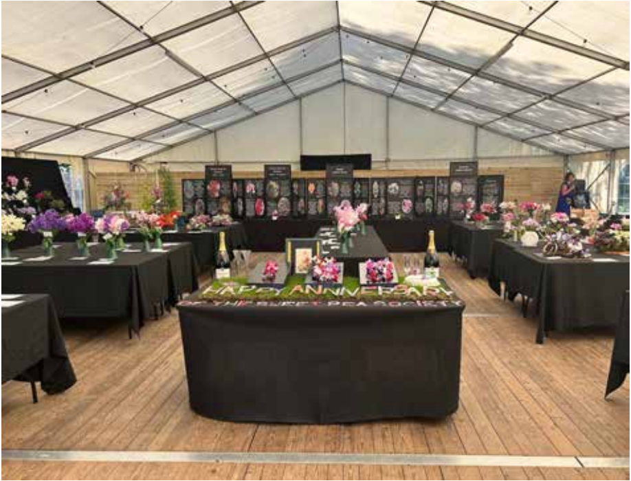
All ready to open for the public!

Good Luck growing your sweet peas this season. I look forward to seeing you in July 2026 as a competitor, helper or a visitor.