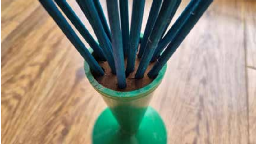
Close-up of the 15 'stems' in Oasis Renewal

I will have no qualms in taking it to try at 'live' shows in 2026. I will aim to use it for many of my show vases (including sweet peas) but I will also continue to use my own 3D-printed Staging Rings for some of my large-vase exhibits and also continue using Agrawool/FibreFloral for large display bowls (where rings aren't practical). My guess, at this point, is that I may stage roughly 1/3 rd Renewal, 1/3 rd Staging Rings and 1/3 rd Agrawool in 2026. Reality might prove otherwise; I will have to see how it goes.