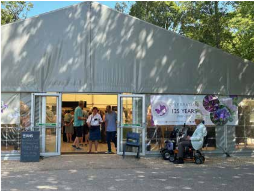
The Show marquee at RHS Bridgewater from the outside

We will again be holding this event in the Show Marquee, which has a large display area and plenty of room for the public. Access to the Marquee for staging is gained on arrival at Bridgewater; pass through the green gate and take the first left. You will then come to a coded gate (code will be provided with confirmation of entry). Follow the road down and to the left, parking is next to the Volunteers facilities. There is a gate out of the car park to the marquee, and help will be provided to carry exhibits the short distance if required. Access for direct unloading in front of the marquee will be before 10am and after 6pm only.