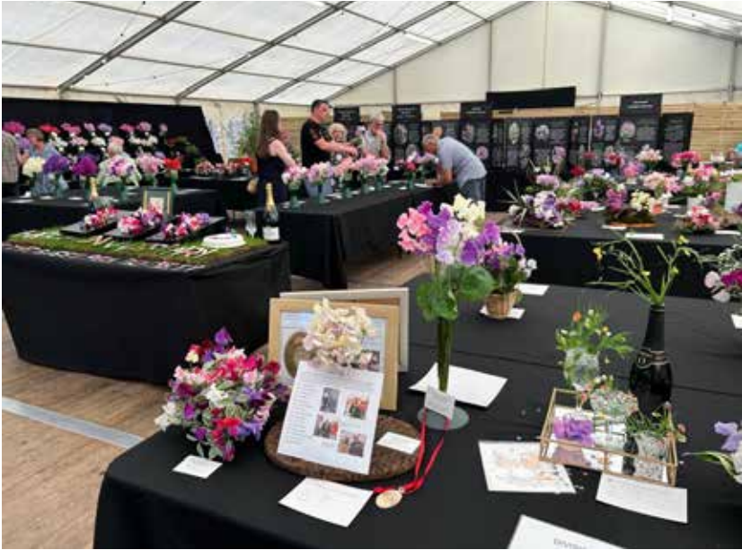
The judging well underway in 2025

If you want further details, please don't hesitate to contact me. I am looking forward to lots of entries which I know will always be weather dependent but don't worry, just bring what you've got! One vase is better than nothing. Please note, staging is up to 9.15am on Saturday which gives members with fewer entries, time to stage on Saturday morning. We will be presenting the awards at 1pm that afternoon.