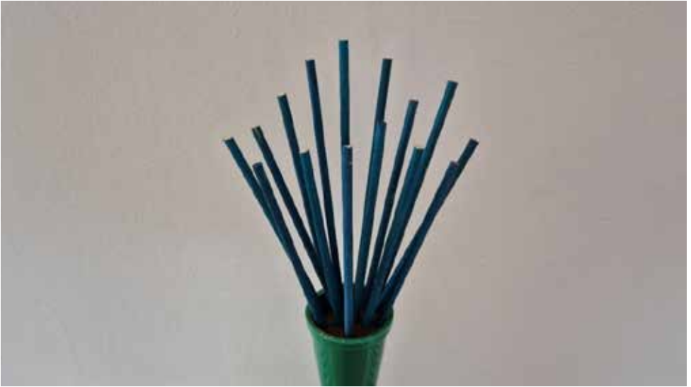
A fan of 15 'stems' in Oasis Renewal

You can see from the second (brutal) close-up that I've experimented by moving a couple of the canes, and again, it felt similar to using traditional foams. What you can't see from this picture is that I was extremely economical with the cone of material used here; it doesn't go very far down into the vase, only about 30 mm. Again, this was done deliberately as a really hard test of the material; would it hold with stems only pushed in a very short distance (for those of us without the luxury of really long stems to play with)?