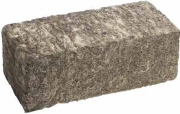
Oasis FibreFloral Brick

I have also been given a Floraguppy to try. An ingenious recyclable and reusable plastic design which is mouldable to different vase sizes. It looks exciting for arrangements but doesn't solve the problem for staging a traditional vase. Costs £7.49 per guppy.